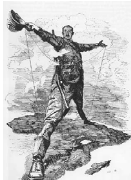
Pax Britannica and the Race for Africa, 1870–1900.