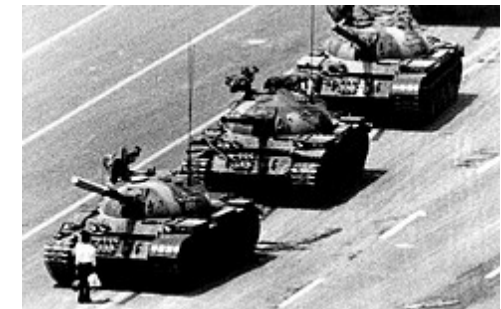
Man versus Machine? Tiananmen Square protest, 1989.