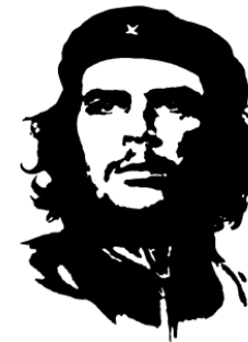
Revolutionary Che Guevara. Assassinated on the orders of the CIA in 1967.

Do you enjoy reading or talking about Politics and International Relations?